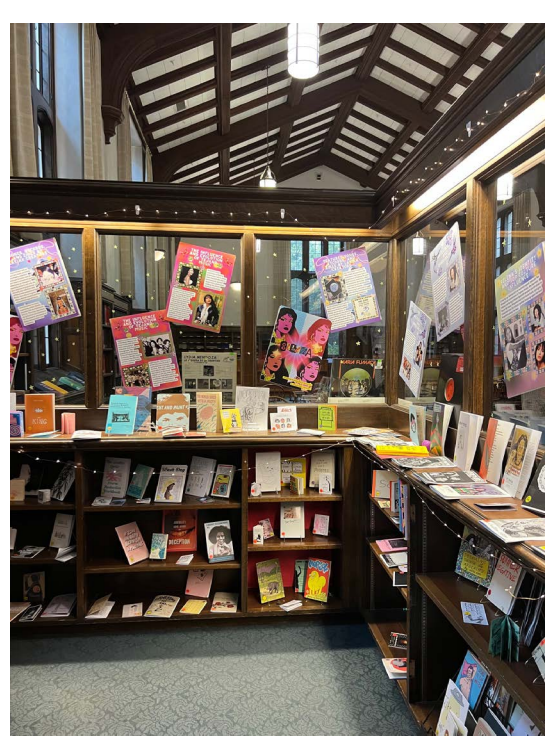
Figure 1 The Reed Zine Library