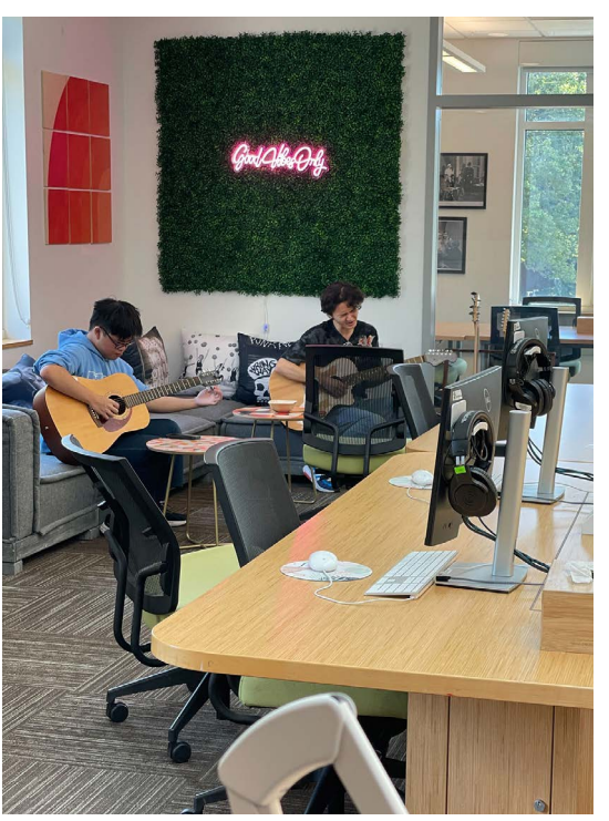
Figure 2 Students hang out in the Performing Arts Resource Center

to revisit the zine collection that had sat dormant for a year and a half in order to represent the COVID-19 pandemic experience and to capture zines covering the 2020 racial justice reckoning and other emerging student interests such as accessibility, sexuality and gender, and DIY/punk culture. The Zine librarian hired student interns to develop displays and exhibitions that included the Zine Library space and envisioned new forms of zine-related programming. The result of two years of effort was more than 150 new zines added into the collection, four student interns hired to focus on programming and exhibits, and 10 zine-making workshops. Newly engaged student groups, such as the Queer Student Union, the Latinx Student Union, the Multicultural Resource Center, and the Students for Education, Equity and Direct Service showcased and celebrated zines they created.