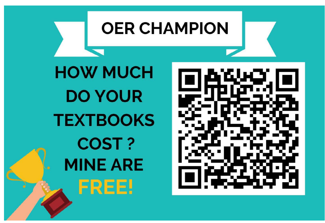
Figure 3 OER Sticker

My intention for this marketing campaign was for faculty already using OER to feel proud of what they were doing for their students (and themselves), for students to recognize what their instructors were doing, and for other faculty to perhaps be envious enough of the poster to give me a call. Buy-in is the driving force of textbook affordability work; without faculty participation, there is only so much I can do. Investing in faculty and student awareness and showing gratitude for those who engage in textbook affordability work are imperative to my program's success.