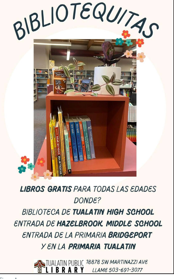
Figure 1 The Bibliotequita Poster for Schools

what we projected. We were hoping to reach more people through public schools. In retrospect, we realized there may have been confusion about the free books amongst the student body. We were also unable to promote the program effectively. Traditional methods of promotion through library programs and newsletters were not yet reestablished, and physical access to the schools was limited. Our partners at the schools were working so incredibly hard to help students adjust post-pandemic, and could not devote time to promoting our program. As a result, we determined that our school model was not effective enough. The schools were adjusting to a regular school year. Students were also adjusting to school routines. It was clear that schools were struggling with student's needs and dynamics. The more we spoke with teachers and family partner advocates, the more apparent