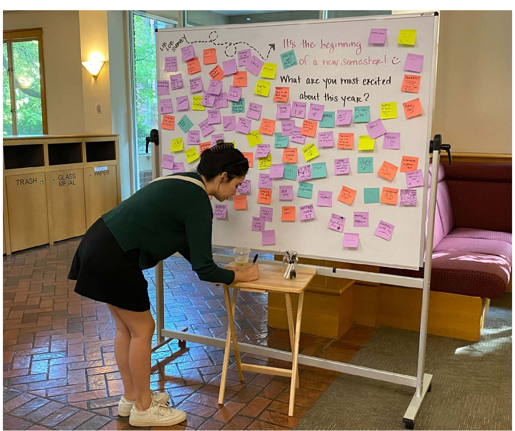
Figure 3 A student adds a comment to a talk-back board in the library lobby

Reimagining the PARC meant providing a comfortable and inclusive hangout space where students could study, practice music or theater, and engage with faculty. Through the addition of artwork, a listening station featuring a new vinyl collection, and a modular couch, the PARC became a cozy hangout area that students gravitate to. As a result, student use and circulation of items increased.