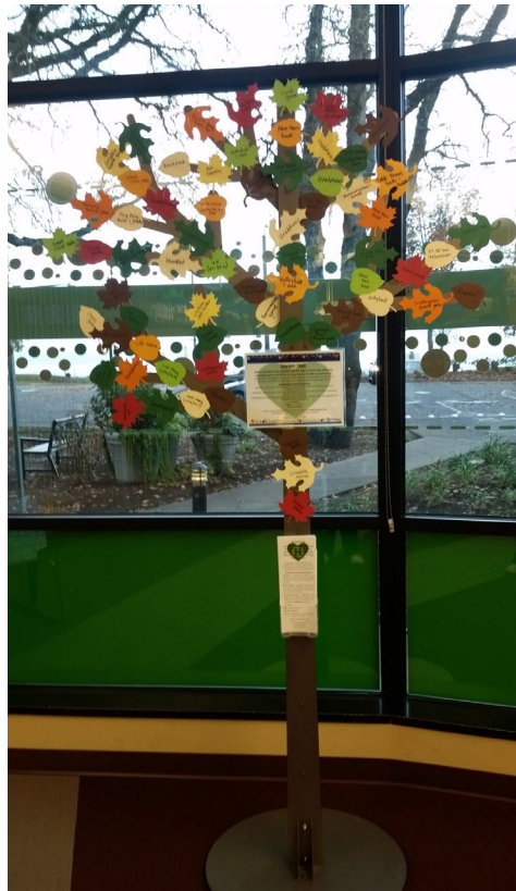
A giving tree near the library entrance with gift suggestions to support the Harkins House holiday gift drive.

personal hygiene products, socks and information about available Washington County social services. As staff interacts with or assists a patron who openly shares their struggle to find housing, wash their clothes, take a shower, find a hot meal, etc., staff are able to offer minor relief with a Care Kit prepared by the HPL Cares team. The Care Kits have become a tool, assisting staff as they navigate tough patron interactions. The scope of library work does not always allow us to assist patrons to the extent that we would like, but the Care Kits provide staff the opportunity to build trusted relationships with patrons and discreetly say “We Care.”