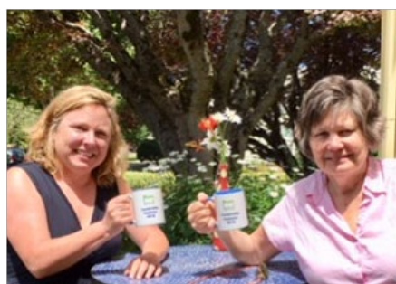
Cheers to the Leadership Institute of OLA (LIOLA)!