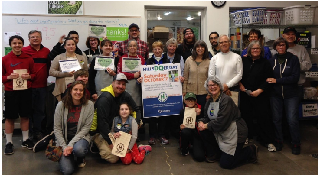
HPL staff and patrons at an Oregon Food Bank food packing event.