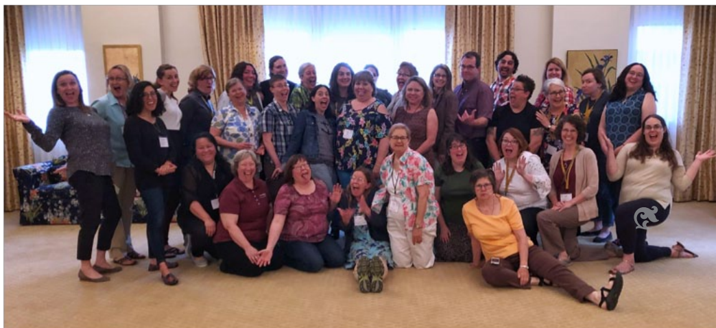
The participants, mentors and staff of LIOLA 2018.