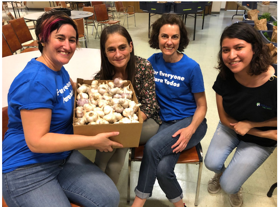
HPL staff at the Adelante Mujeres veggie packing night in support of local CSA programs.

As the HPL Cares team continues to expand the supportive reach of the library throughout Hillsboro, the team also pursues ways to assist staff as they serve the many diverse groups of people converging within the library. As the population continues to grow and rental costs quickly increase, Hillsboro has experienced an uptick in citizens struggling with housing insecurity. As a welcome space for everyone, Hillsboro Public Library invites all people to utilize library services. Library staff members find themselves spending an increased amount of time helping connect houseless patrons with support services located throughout the city. At times, staff struggle to connect patrons with agencies that are stretched beyond their capacity. Staff members have expressed not only their frustration, but also their desire to do more for library visitors. In response, the HPL Cares team devised a plan to solicit donations from patrons and staff to help create Care Kits. Care Kits include small snacks,