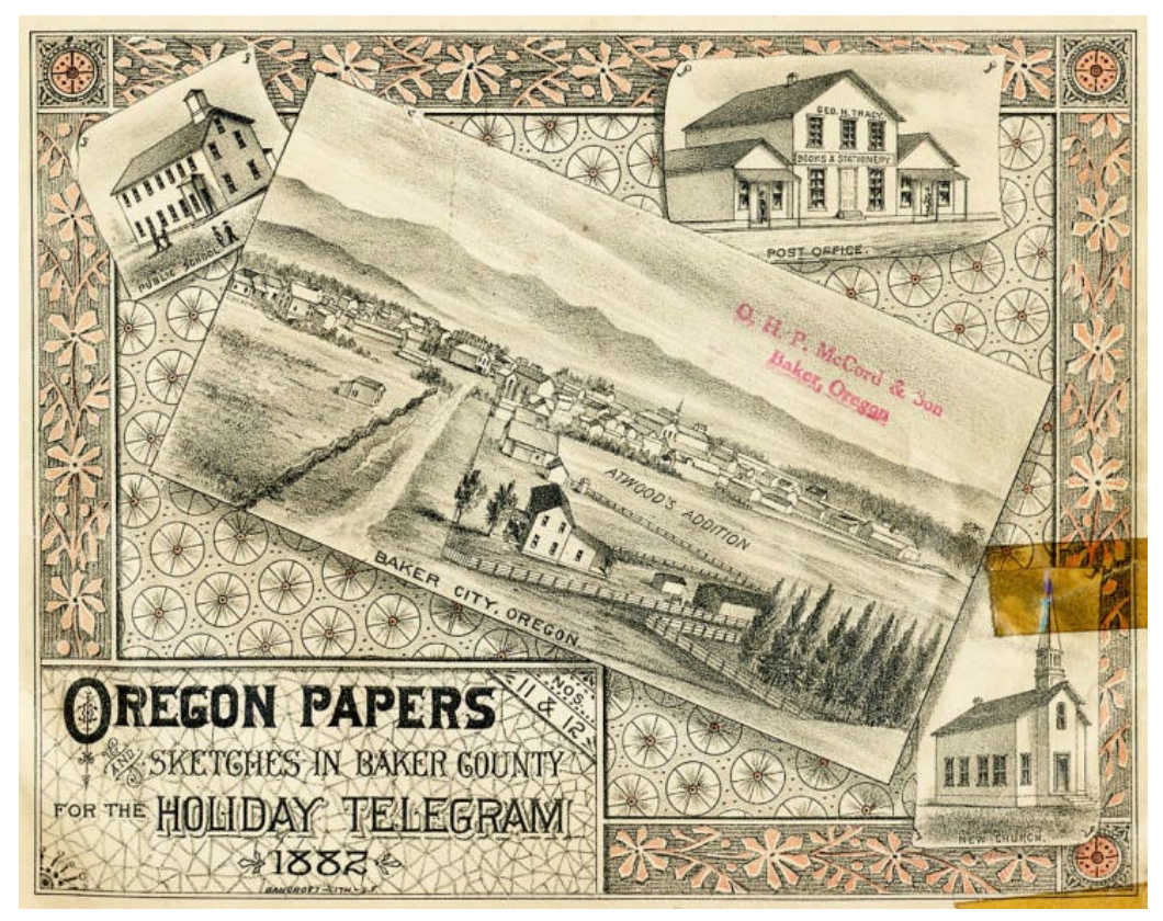
Sketches in Baker County, cover of booklet, 1882." Courtesy of the Baker County Library District, Baker City, Oregon."