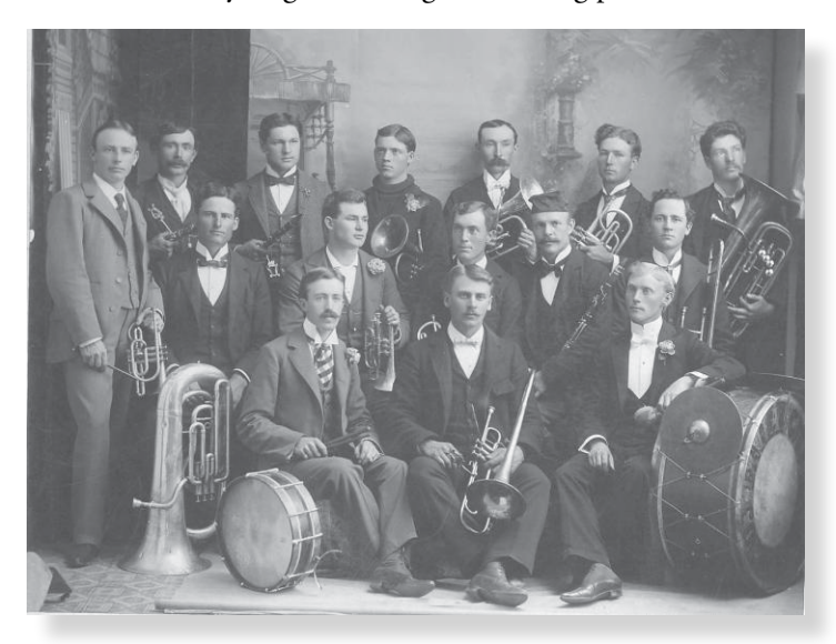
Baker City Coronet Band, 1897.

The experience of this pilot project has also provided the State Library of Oregon with more data and additional aspects to consider with furthering a cross-state partnership with the Washington State Library. Both state libraries and BCLD have agreed to continue a second year of migration efforts, in the hopes that a larger portion of the BCLD collections can be efficiently migrated using the existing practices and documentation.