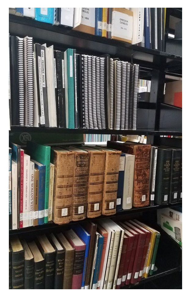
Oregon censuses and pedigree books at OGS.

coordinator for two years, has more than 14,000 items in its collection representing all 50 states as well as 22 countries. Holdings include 940 family histories, well over 3,000 periodicals, and a large Oregon collection that covers all 36 counties, the Oregon Trail, Western Frontier, and Northwest Territory. Of special interest are the 13 volumes of Record of Proceedings, Grand Chapter, Order of Eastern Star, Oregon (related to the Masonic Fraternity), and The War of the Rebellion: A Compilation of the Offi cial Records of the Union and Confederate Armies and Navies.