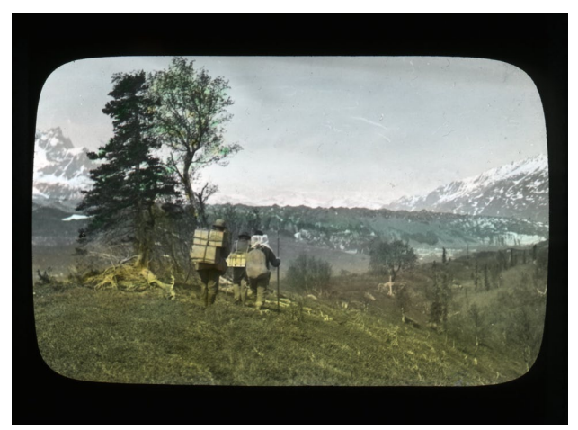
Lantern slide from the C.E. Rusk Collection.

cally valuable to Pacific Northwest mountaineering.