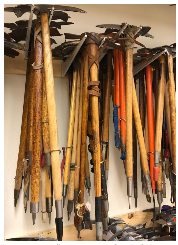
Historic ice ax collection, Mazama Library and Historical Collections.

In the mid-1980s, two volunteer Mazama librarians conducted a survey of mountaineering libraries and mountaineering collections in the United States. Through their research, they found 13 specialized libraries and eight specialized collections