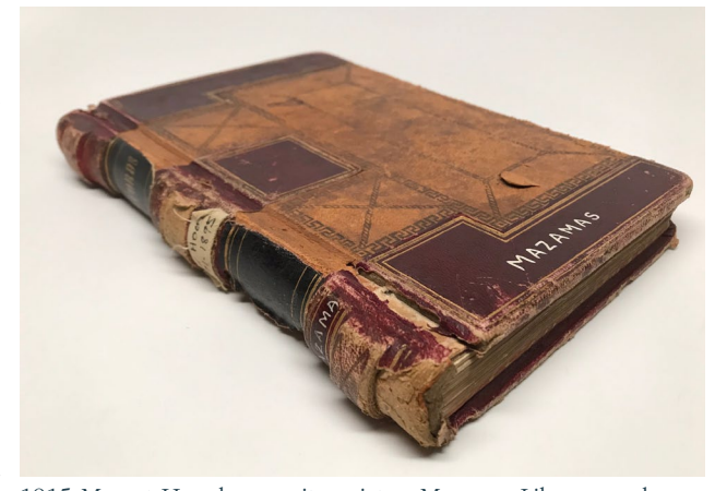
1915 Mount Hood summit register, Mazama Library and Historical Collections.

The two most-used collections in the Mazama archives are the summit register and glacier research collections. For almost eighty years, the Mazamas managed the registers on the summits of all the principal peaks in the Northwest. The logs, many in custom-made aluminum boxes designed and manufactured by the Mazamas, record the names of climbers and the date they reached the summit. The registers also encompass a wealth of observational data on the climate, geology, and glaciology of the mountains