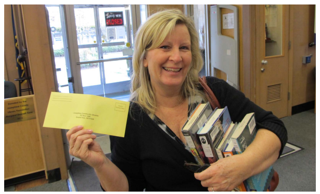
Photographs of residents donating through the Yellow Envelope Drive were featured in social media in an effort to raise awareness about library funding.

Although the Yellow Envelope Drive was a success, the problem of long-term stable funding still existed. We knew we needed to keep the idea of going back to the ballot in the minds of voters. So, we continued to post a web blog that reflected on taxes and the need for public funding. We also sent a direct mail fundraising appeal to all the individuals and families who signed