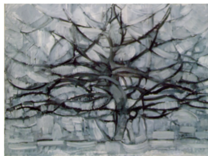
Figure 5. Piet Mondrian, Grey Tree , 1912, Oil on canvas, 785 x 107.5 cm, Gemeentemuseum, Slijper Collection, The Hague.

Lacan invokes the tradition of Dutch and Flemish landscape, and it may be that the presence of the gaze is felt most uncannily in paintings focused on the materials of camouflage—trees, grasses, undergrowth, etc.—and in which “any