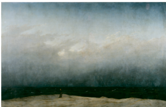
Figure 3. Caspar David Friedrich, Monk by the Sea , 1809, Oil on canvas, 110 x 171.5 cm, Nationalgalerie, Berlin.

of the picture's flat surface or expand into illusions of infinite recession toward remote unseen horizons." 11