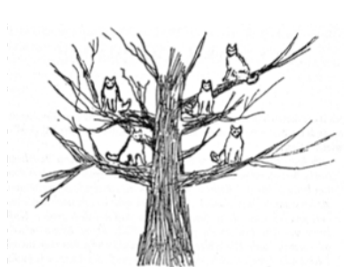
Figure 4. Illustration from Freud’s Beyond the Pleasure Principle .

The feral undertow of captivation is explored and to an extent theorized by Freud at a step in his analysis of the “Wolfman.” Freud’s patient reported having a dream as a young boy—his first anxiety-dream. He dreamt that the window at