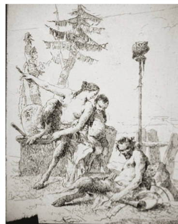
Figure 8. Giovanni Battista Tiepolo, Scherzi/Satyr Family , 1742/63, Etching, 226 x 176 mm, National Gallery of Art, Washington, Rosenwald Collection.

contemplate the bronze figure of a serpent—“a gesture that marks the discovery that evil can be cured by its image.” 35 In this gesture we may recognize the aforesaid “capacity to turn the violence of life back against its own violence.” But