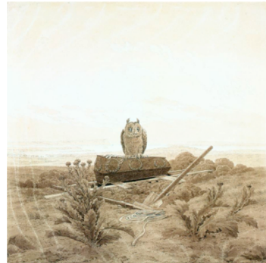
Figure 7. Caspar David Friedrich, Landscape with Grave, Casket and Owl , 1836/37, Sepia, pencil and charcoal, 48.5 x 38.5 cm, Kunsthalle, Hamburg.

Friedrich’s Landscape with Grave, Casket and Owl (1837/38), a study in pencil and sepia, is a remarkable pendant to those many figures seen from behind—the Rückenfiguren that are his stock in trade. The owl, given its uncanny ability to rotate its head, is uniquely suited to the tropism endemic to a story—Conrad’s—in which the platform of the narrative is the deck of a boat that is shifting on its mooring with the turn of the tide. 32 By story’s end it is facing in the opposite direction—a reversal consistent with the inversion ( Verkehrung ) named by Freud. This turning is also germane to the novella’s apotropaic aspect, of which those severed heads on posts are also examples. In turning, their purpose is to “turn