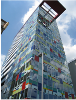
Figure 1. William Allen Alsop (architect), Colorium, Düsseldorf, 2001 .

of primary color and non-color isolated within uneven but severe grids of emphatic black. The insistent flatness that characterizes his mature style (after 1920) provides a platform for the taut interplay of autonomous, non-identical elements whose precise positioning creates both a rhythmic balance and a visual pulse.