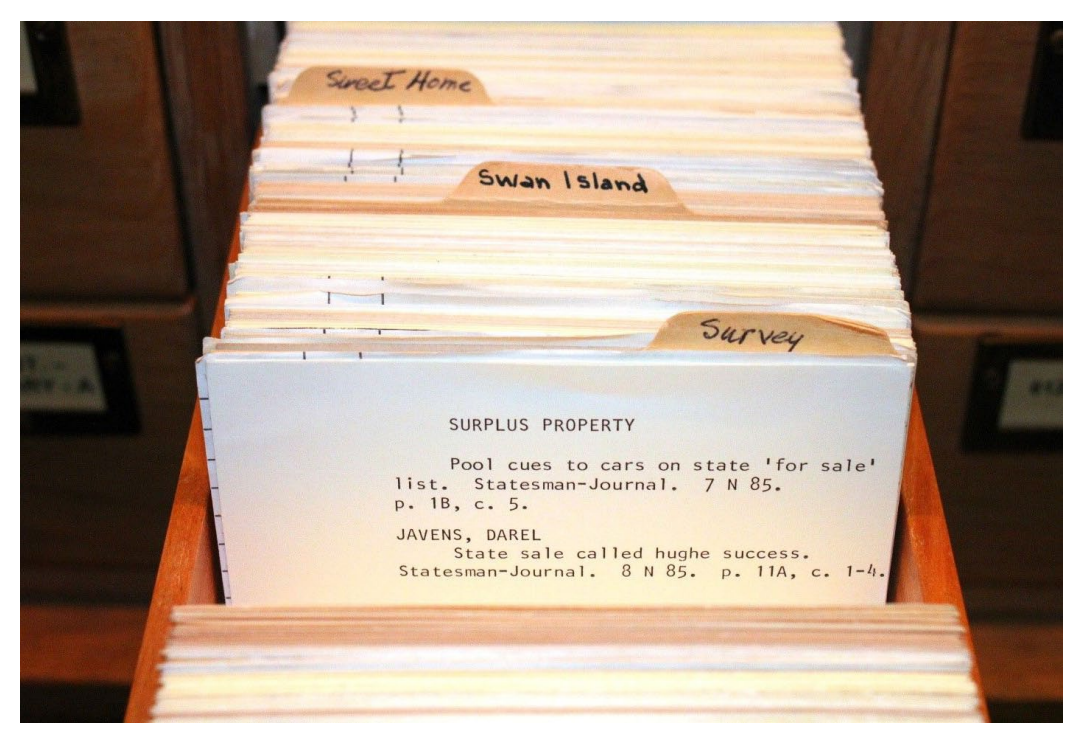
One of the physical Oregon Index drawers with the cards and dividers.

The first step to being able to put the Oregon Index online was scanning the Biography section, which was completed through a project in partnership with the company Ancestry. An agreement was signed in February 2010. The materials for this project came from several State Library collections, including the cards from the Biography section of the Oregon Index, which was the top priority for the project. Ancestry provided a digital SLR camera mounted on an overhead copy stand and hired a contractor to perform the scanning of the cards on-site. The scanning began in April 2010 and was completed in 2011. The output from the Biography section was 244,044 color TIFF images.