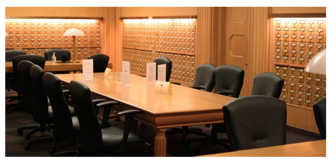
The physical Oregon Index at the State Library of Oregon.